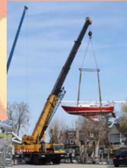
Brian Thompson's Looking Glass