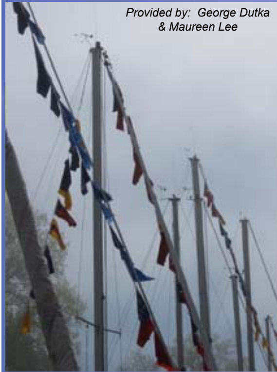
Tops of Sail Past dressed boats