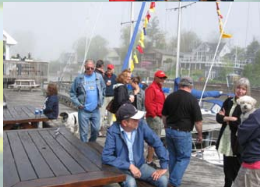
Foreground to back: