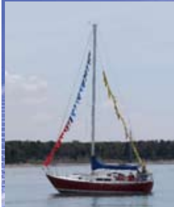
Left: Brian Thompson's Looking Glass Sail Past dressed