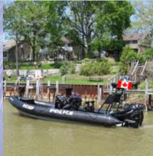
The RCMP boat cruising the river for drugs & alcohol abusers or drinking violations on moving boats